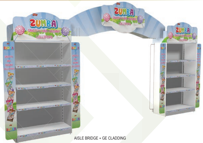
AISLE BRIDGE + GE CLADDING