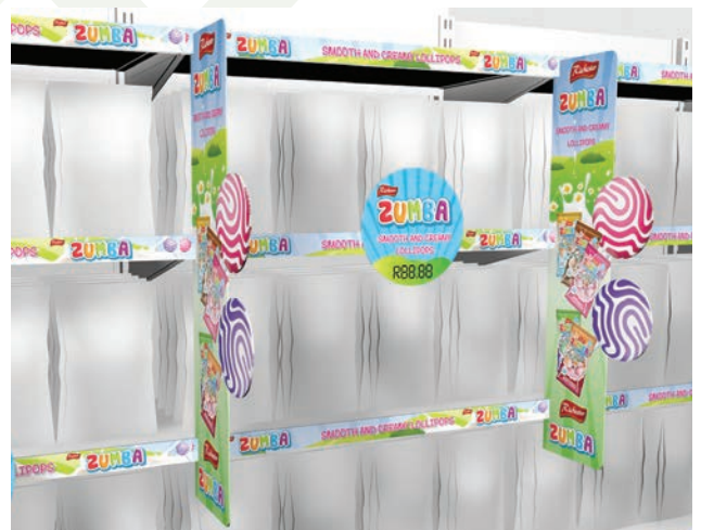
ON-SHELF SOLUTIONS - AISLE BLADE, SHELF DEFENDER & WOBLER