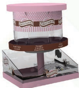
SEMI PERMANENT HOTSPOT UNIT