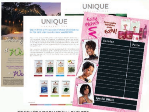
PRODUCT INFORMATION LEAFLETS

ENTRY FORMS • VOUCHERS • LEAFLETS • FLYERS • PRICE BOARDS • WOBBLERS • LABELS • CATALOGUES • CALENDARS • POSTERS • BOOKLETS