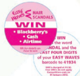
LABELS & STICKERS