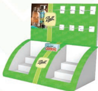
CORRUGATED HOTSPOT UNIT