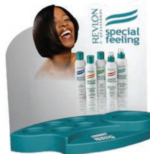
VAC HOTSPOT UNIT