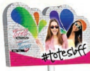
CORRUGATED DIVIDER DUMPBIN + HOC