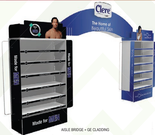
AISLE BRIDGE + GE CLADDING

AISLE BRIDGES • GONDOLA ENDS • POWERWINGS •