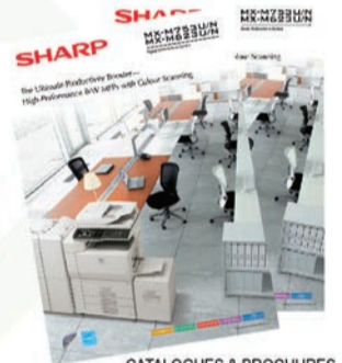
CATALOGUES & BROCHURES