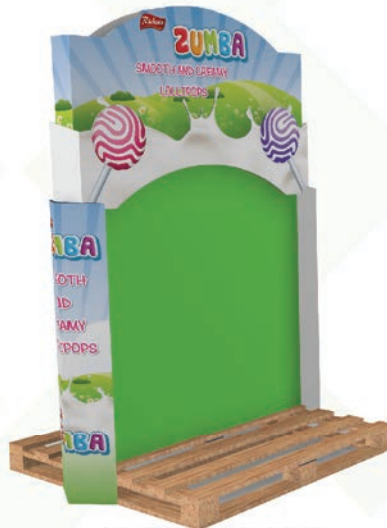
CORRUGATED DIVIDER DUMPBIN