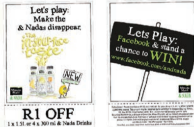
ENTRY FORMS AND LEAFLET VOUCHERS