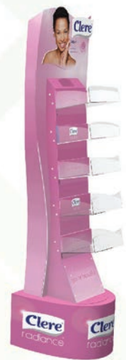
SEMI PERMANENT FSU