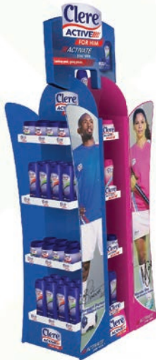
CORRUGATED 3 SIDED FSU