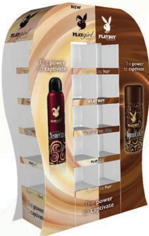
CORRUGATED 3 SIDED FSU