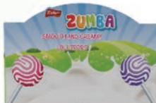
CORRUGATED DUMPBIN + HOC