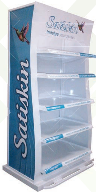
PERMANENT GONDOLA END UNIT