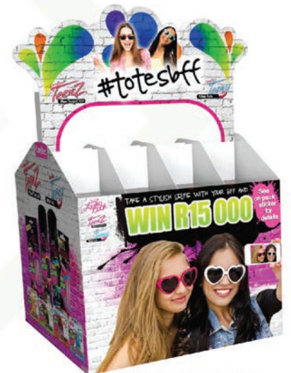
CORRUGATED DIVIDER DUMPBIN