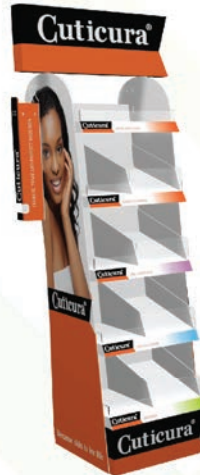
CORRUGATED FSU + PARASITE ADD ON