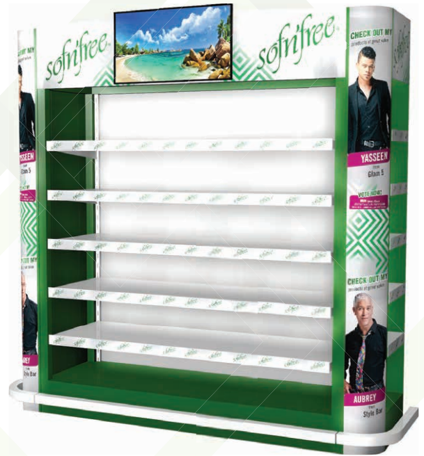
PERMANENT GONDOLA END UNIT