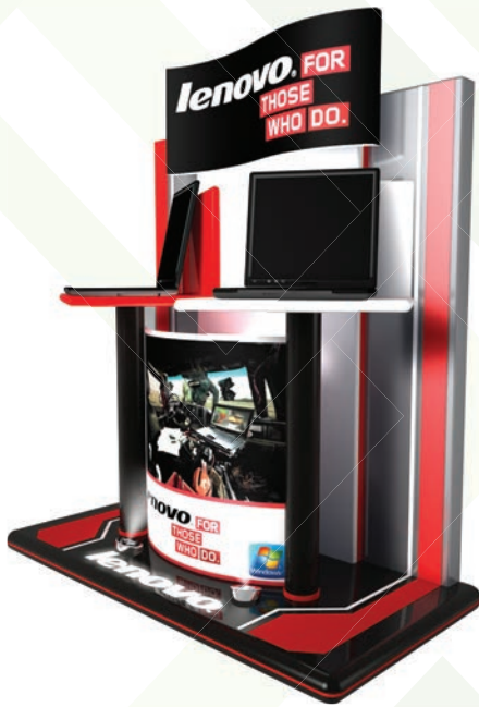
PERMANENT DISPLAY STAND

FLOOR STANDING UNITS • DUMPBINS • PARASITE UNITS • GRAVITY FEEDERS